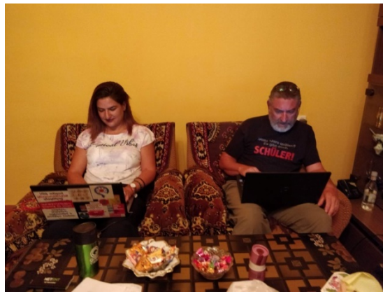
Working on the report