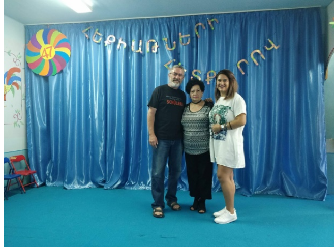
After the interview