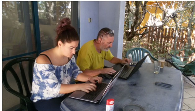
Working on the report

Sixth day: incorporating the transcription of the interview with the questionnaire and writing the first draft of the report.